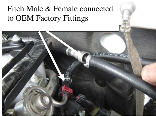
Fitch Male & Female connected to OEM Factory Fittings