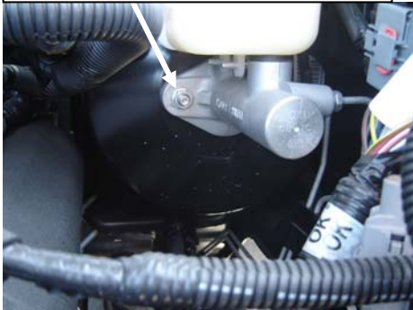
Brake master cylinder stud

Mounting location: Brake master cylinder stud (using OEM factory nut/stud to attached Fitch mounting bracket & Fitch canister)