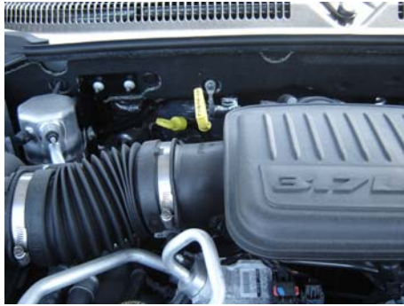
5/16 OEM Quick Connect